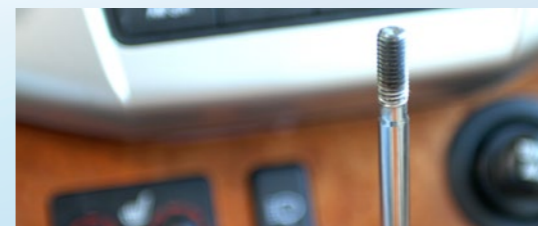
Missing parts or equipment

Photos are examples only. Covered wear and use items must be within plan limits.