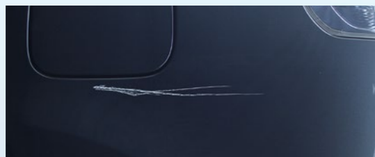
Damaged bumpers, body dents, dings or scratches