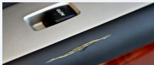
Interior cuts, burns or stains