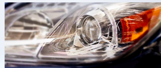
Broken or scratched windshield, windows, mirrors or lights