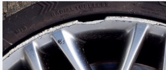
Damage to tires, rims or hubcaps